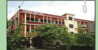
Vivekananda Mission School