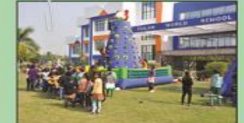
Pailan World School